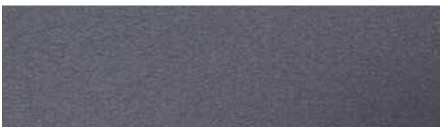
Metallic Dark Silver RR41/SS0044