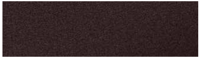
Chestnut Brown RR887/SS0435