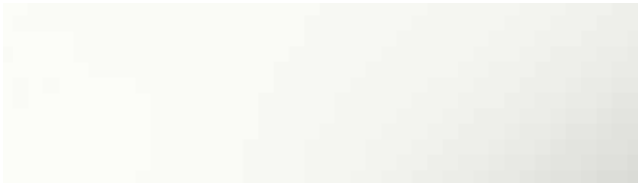
Snow White RR19/SS0001