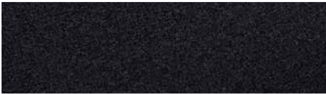
Nordic Night Black RR33/SS0015