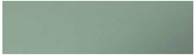
Silver Fir Green RR5J3/SS0975