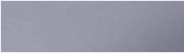
Quarry Grey RR287/SS0244