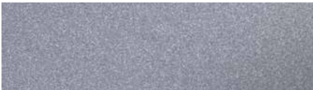
Metallic Silver RR40/SS0045