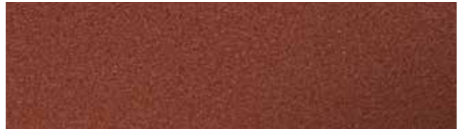
Tile Red RR750/SS0760