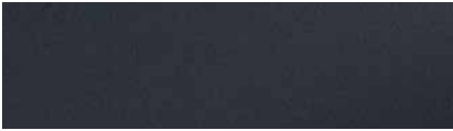
Mountain Grey RR23 / SS0036