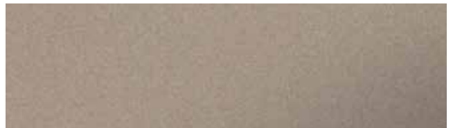
Metallic Gold RR42