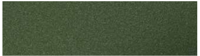
Leaf Green RR594/SS0874