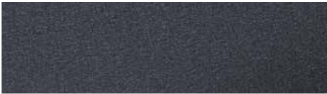
Anthracite Grey RR2H8/SS0087