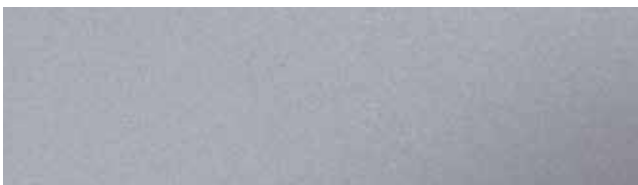
Metallic Sterling RR974/SS6045