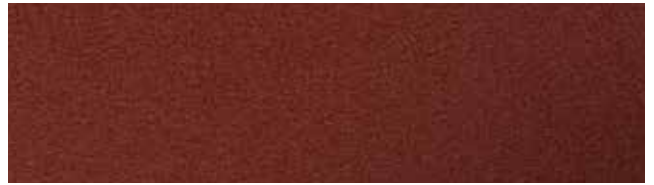
Cottage Red RR29/SS0758